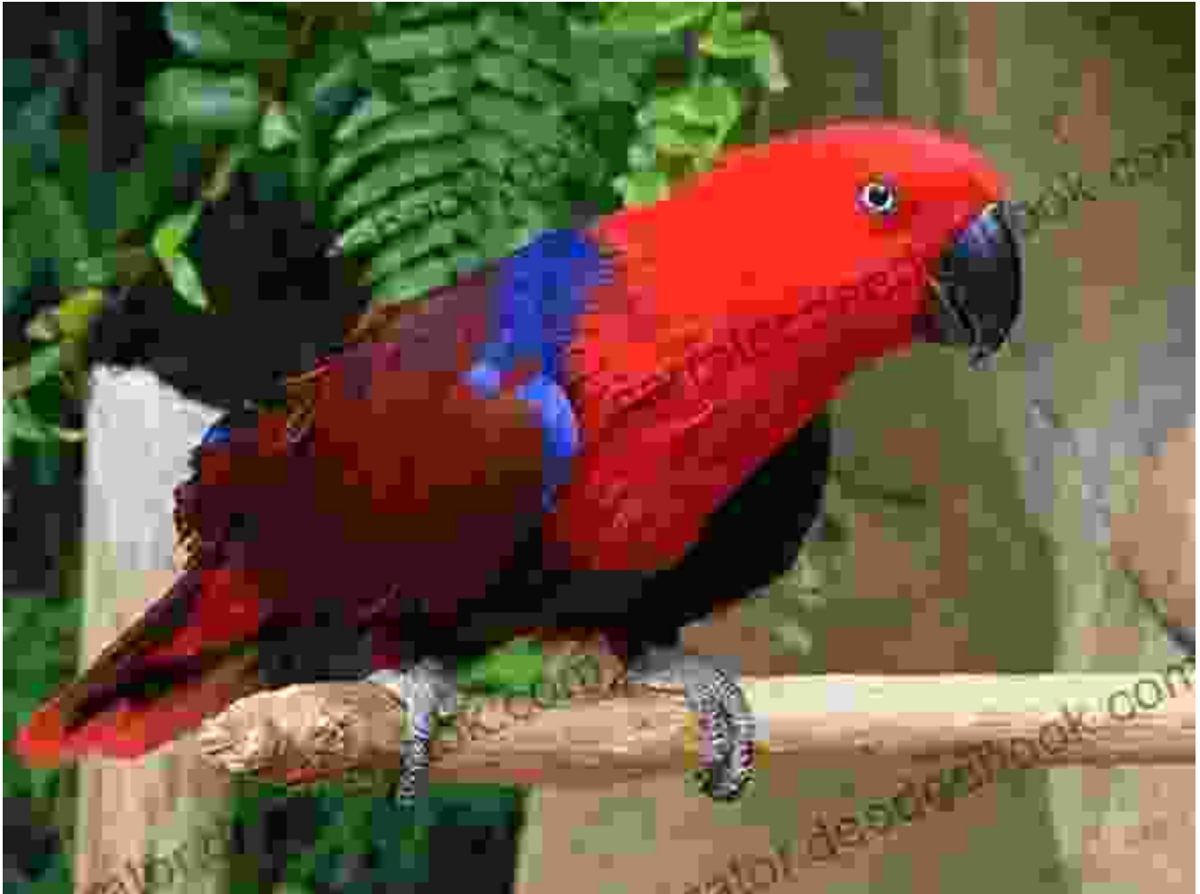
Female Eclectus Parrot