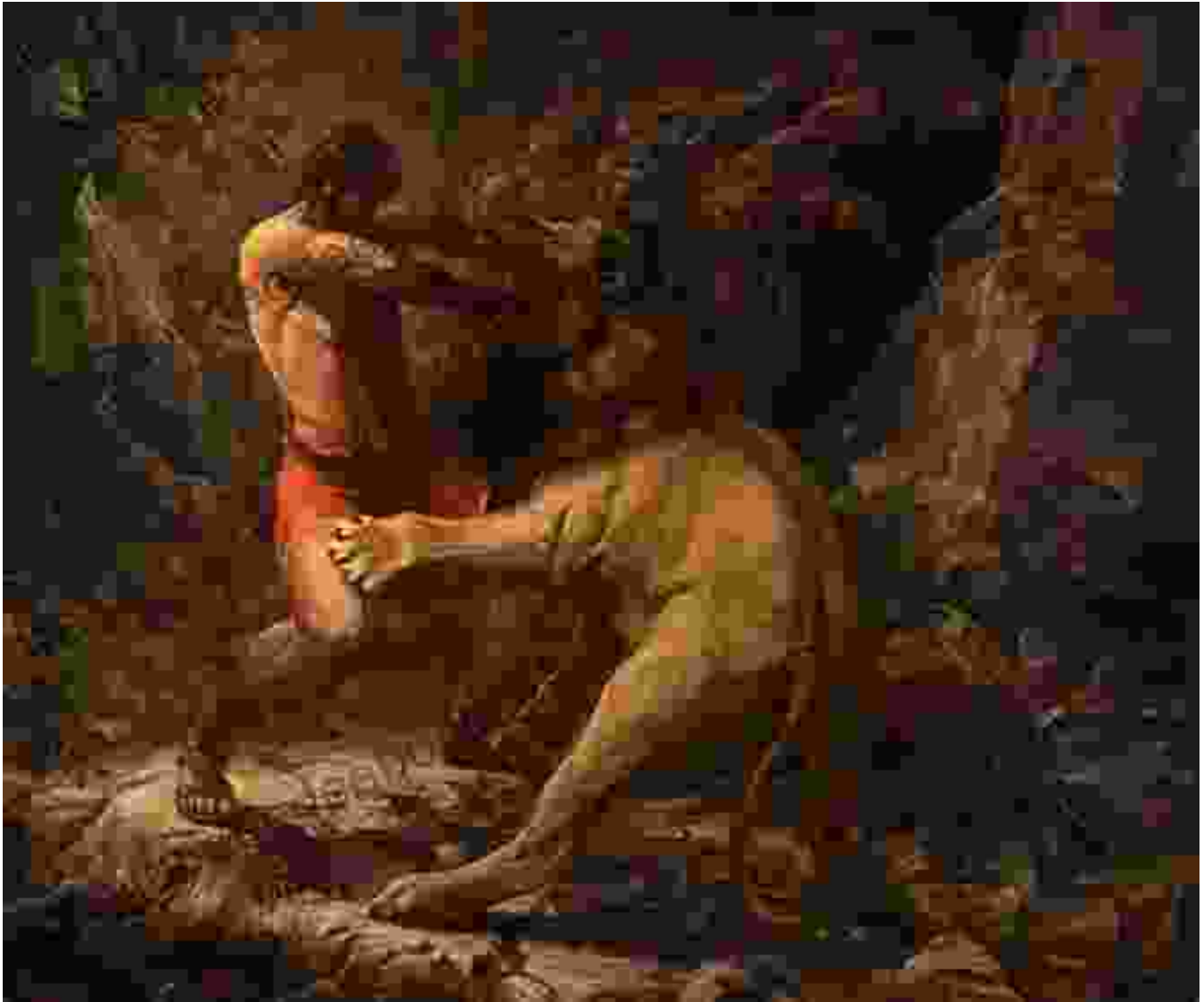
Hercules, the mighty demigod, facing the Nemean lion