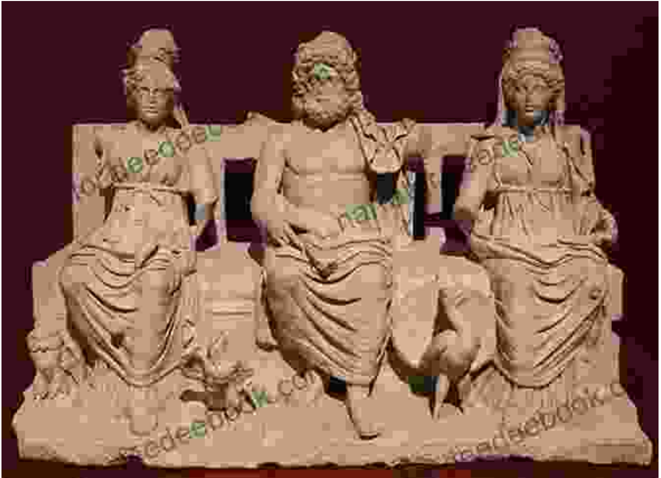
The Roman gods Jupiter, Juno, Mars, Pluto, and Minerva