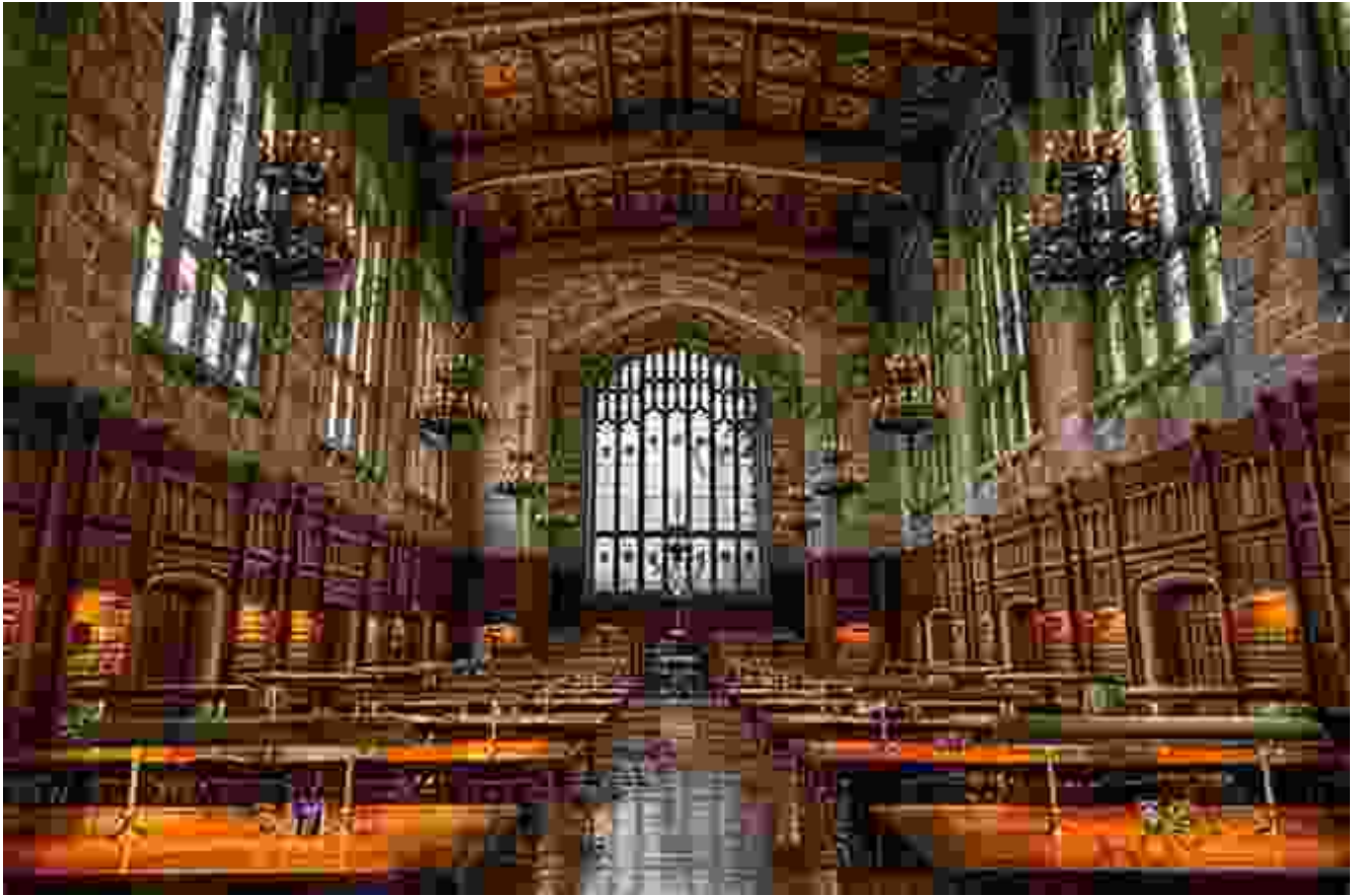
Johann Sebastian Bach