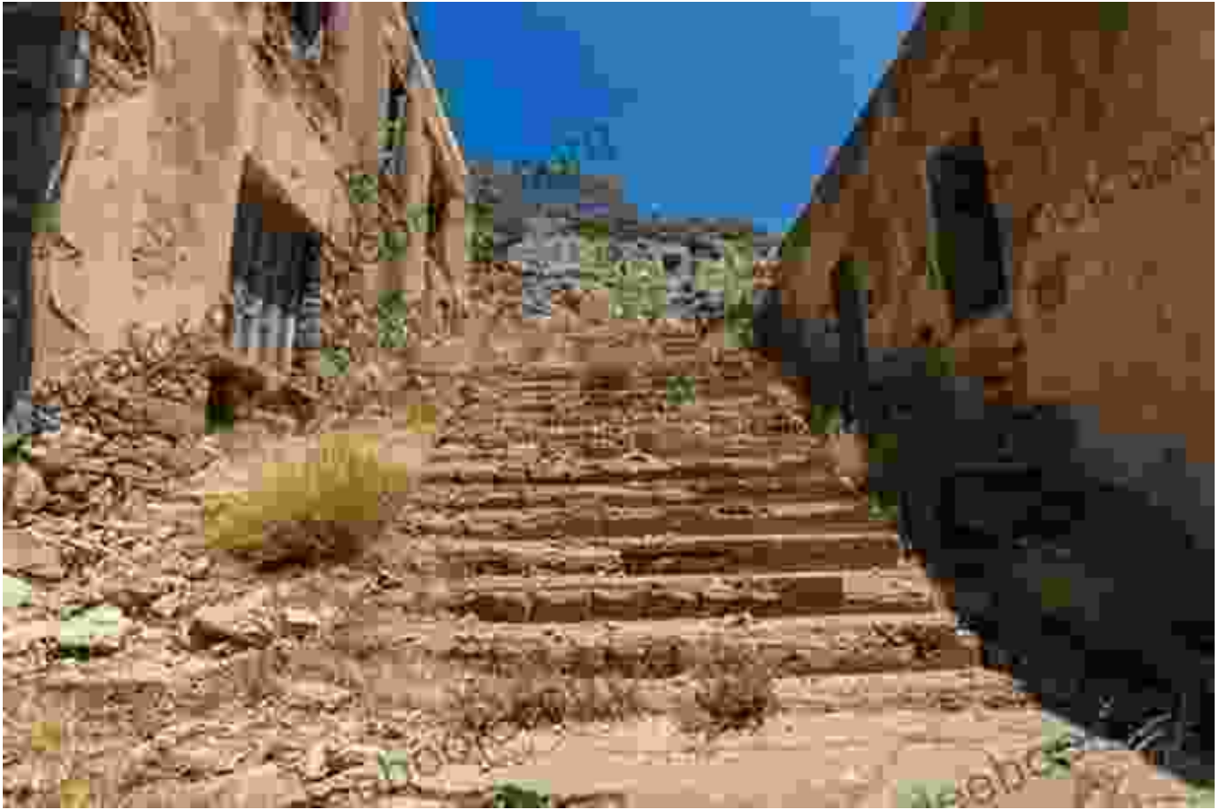
The ruins of the leper colony on Spinalonga