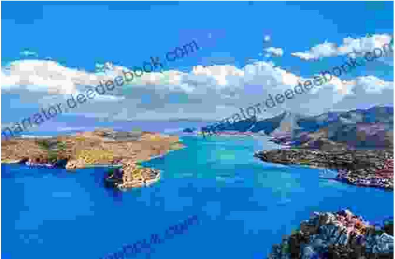
A view of the beach on Spinalonga

Spinalonga is a small island located in the Gulf of Mirabello, Crete, Greece. It is best known for its history as a leper colony, and is now a popular tourist destination.