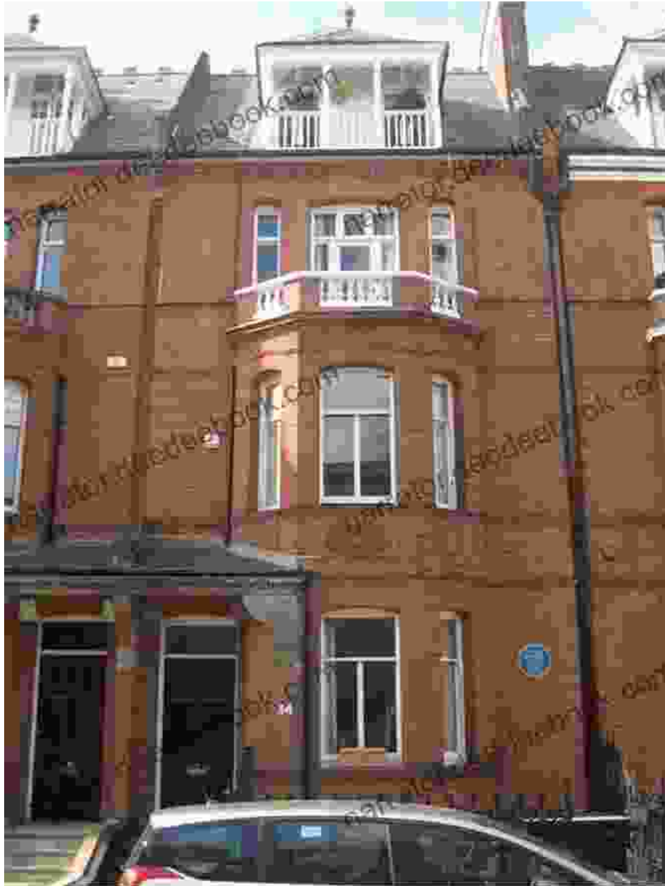
The living room at Sycamore Lane, Oscar Wilde's house in Chelsea, London