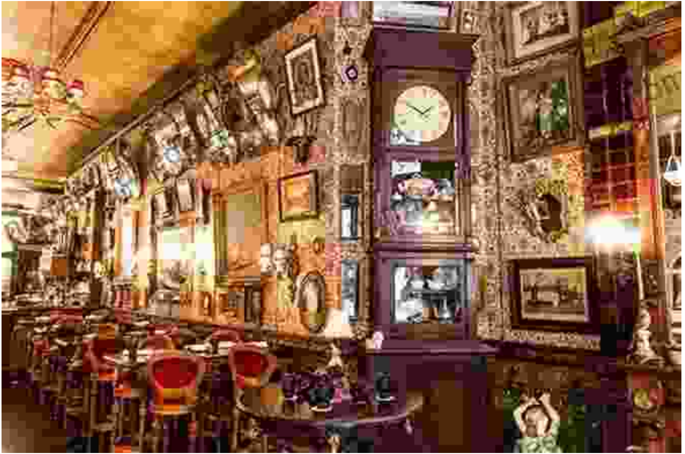
The dining room at Sycamore Lane, Oscar Wilde's house in Chelsea, London